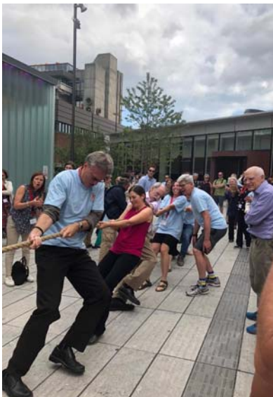
"Team ASCH" at the International Congress on Circumpolar Health (ICCH17), Copenhagen, Denmark, August 2018

ASCH Membership for 2021 is underway. Founded in 1980, ASCH is a non-profit organization dedicated to promoting research, exchanging knowledge and fostering greater awareness and responsiveness to the health of circumpolar people. Networking and collaborative research opportunities have enabled many members to form lasting research partnerships. Membership renewal can be completed by mail, ASCH, PO Box 242822, Anchorage, AK 99524. Request PDF application by contacting asch.circumpolar.usa@gmail.com .